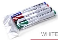
(SETFIXWB) MARKER PENS WHITEBOARDMARKER-SET